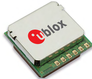
UP501: 22 x 22 x 8 mm